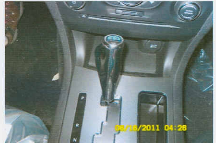
Installed Mopar Shifter